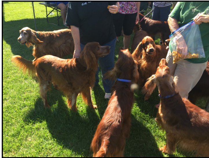
Such a good time, when's the next one (see inside on page 6)